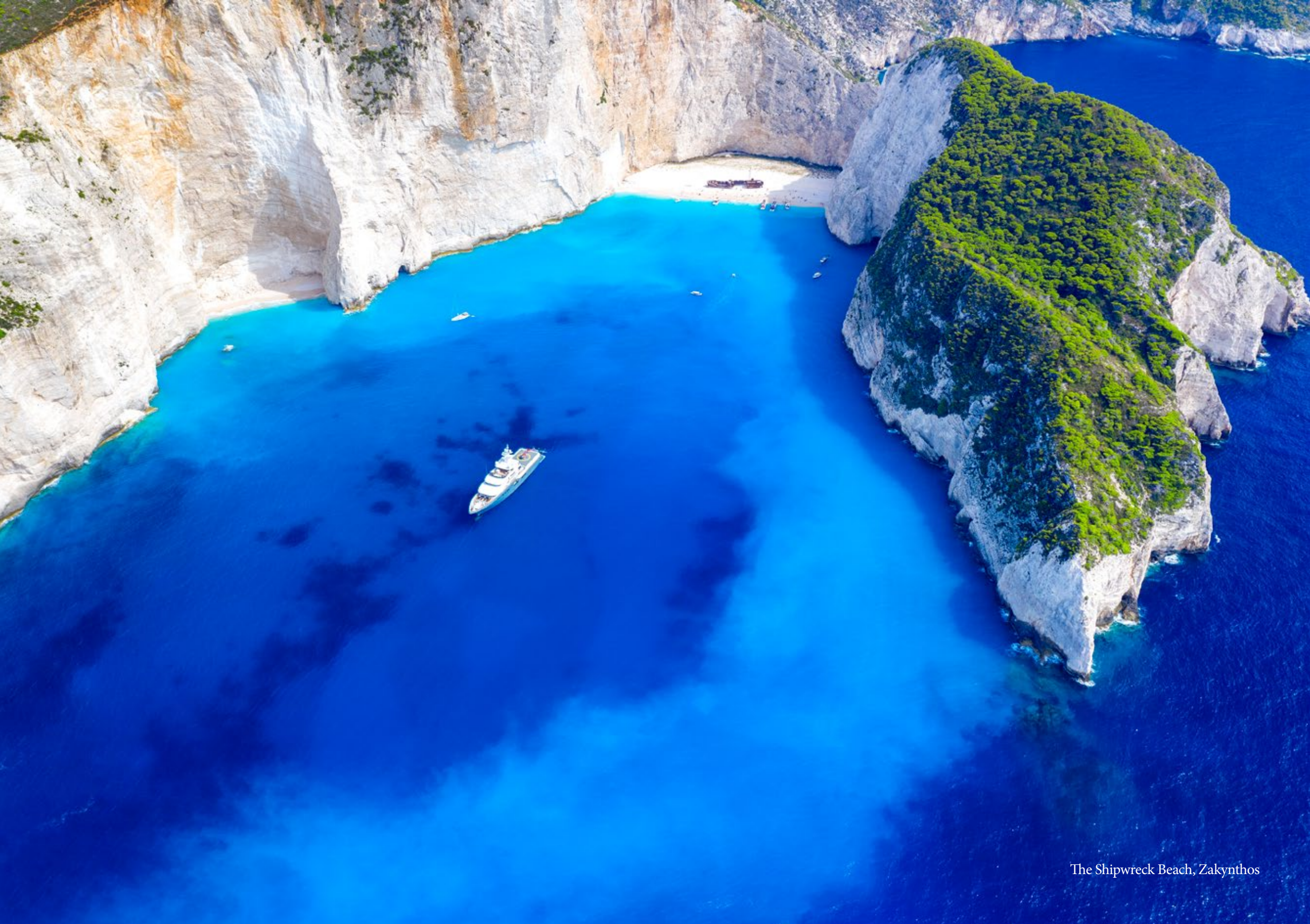
The Shipwreck Beach, Zakynthos